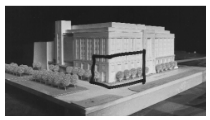
Figure 1. Architects' Model DPB 1935. Subject room marked.

Modern Classicism became the preferred mode for urban federal architecture during the 1930's. The Dominion Public Building (by Hutton and Souter Architects, erected in Hamilton by the federal government between 1935 and 1937), was one of the "...large 'dominion buildings' that were built in many cities across the country to accommodate government offices, using funds released under the Public Works Construction Act."<sup>1</sup>