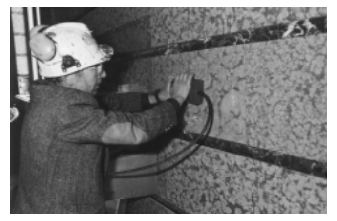
Figure 3. Technician passes 1-GHz antenna across the wall surface.

After a few days of scanning, interpreting, and marking patches on the wall surface, patterns began to appear and a consistency of approach became evident. [An uncanny feeling of being in the presence of the long ago deceased worker laying up this marble is all part of the appreciation of workmanship. Clearly a skilled worker had taken a consistent approach to the same task performed under the same circumstances repeatedly over time. These workers would have understood innately, as we do in the late 20th century, that repetition enhances productivity.] We