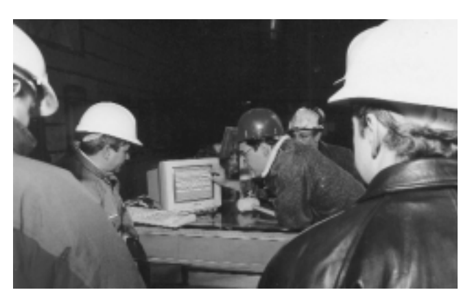
Figure 4. Data are collected and displayed on a monitor for interpretation. With practice, a technician can interpret the wave patterns.