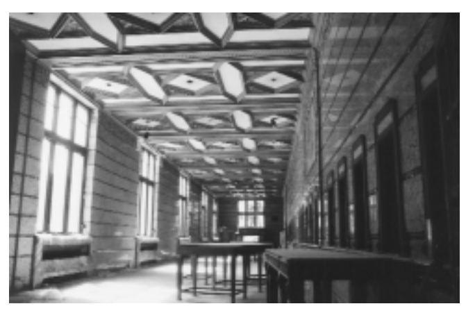
Figure 2. Postal hall of the Dominion Public Building is clad floor-to-ceiling in marble.

The postal hall was a long, narrow room with a proportionately high ceiling. One side wall was pierced by large high windows to the street, while the other was lined with bronze-framed wickets used for the dispensing of stamps and other over-the-counter postal services. Three great electric chandeliers hung from the coffered plaster ceiling. Massive glass-topped bronze desks were provided for the convenience of patrons wishing to address letters. There was a large ceramic-tiled map of the young Dominion of Canada above the stamp windows. Two marble-tiled telephone booths were provided for public use. In all, it was a room designed to impress and engender confidence.