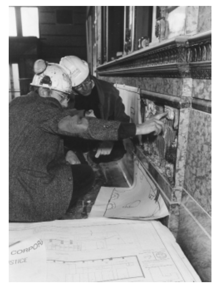
Figure 6. Once the test indicated that the procedure located the plaster adhesive patches with 90% accuracy, the survey continued.

found that most long slabs had three patches along the top edge, one on each end (over the wires), and one or two along the bottom edge. Any plaster in the middle seemed to have been put in at random and was of little consequence. It was probably placed there to cut down on possible vibration of longer slabs.