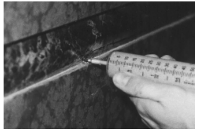
Figure 10. A filled adhesive is applied by injection through the centre of the helix to bond the stainless to the terra cotta. Once set, the straight end is fitted into the angle hole and a drop of Rhoplex placed to hold it.

Full coalescence of Rhoplex MC 76 takes place within 30 days. Testing was carried out using a suction device (the type used for carrying sheets of glass) and a mechanical spring scale. More than 91 kg (200 lbs.)