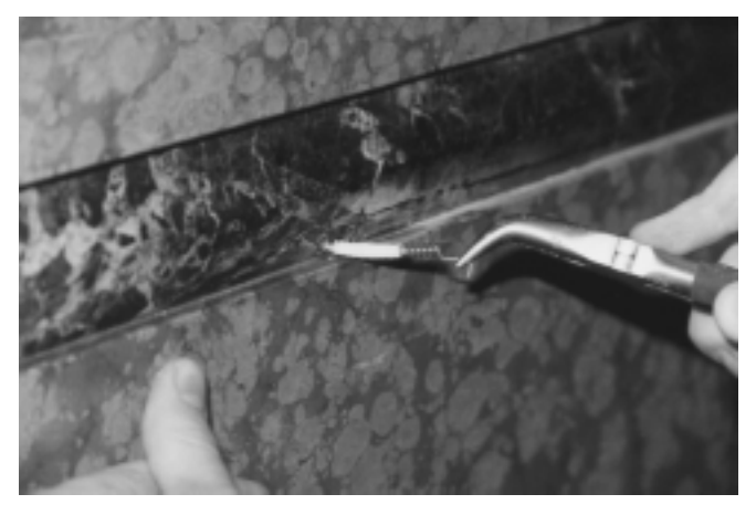
Figure 11. Stainless helical spring is inserted. Note the tail is formed to fit the hole being drilled in Figure 9.

pull was applied to 20 randomly selected locations in the hall. None failed.