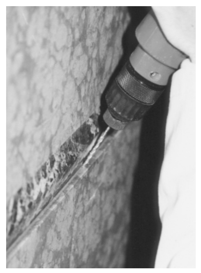
Figure 9. A 0.08-cm ( ^{1}/_{32} -in.) hole drilled at 45° to accept the tail of the mechanical fastener.

plaster of Paris adhesive that had already been seen to fail in so many locations. It was determined that three wire fasteners per average tile would be required.