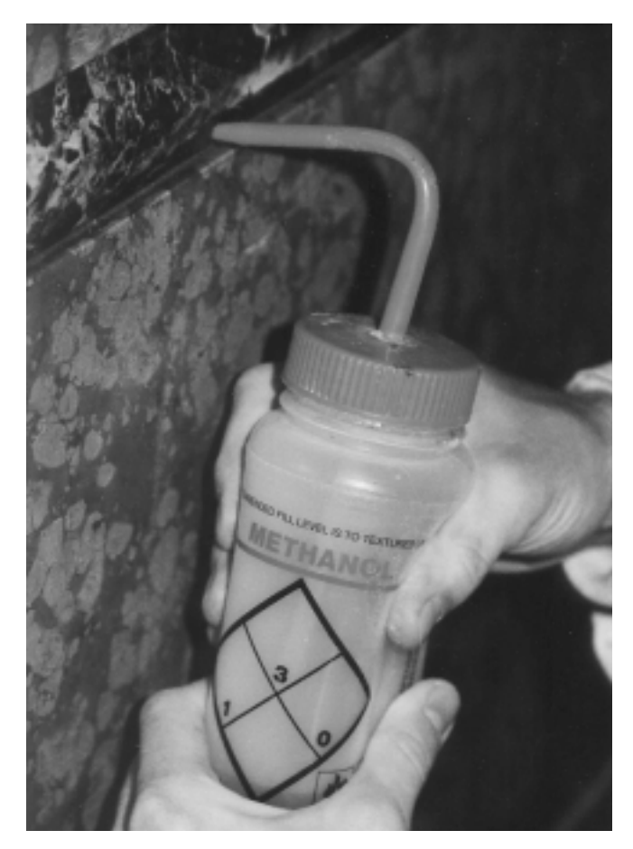
Figure 7. Methanol rinse being applied.

squeeze bottle. This rinsed out or dislodged any polishing rouge on the face of the marble. If the material streamed back out of the hole as quickly as it was delivered, we determined that there was probably no void to be found at this depth in this location. Several attempts were made along the grout line at this depth before it was considered sound. Because we knew that there had been a rattle here when this spot was sounded, we therefore could conclude that the break was to be found at the next level (i.e. between the plaster and the terra cotta).